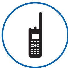
Land Mobile Radio (LMR)