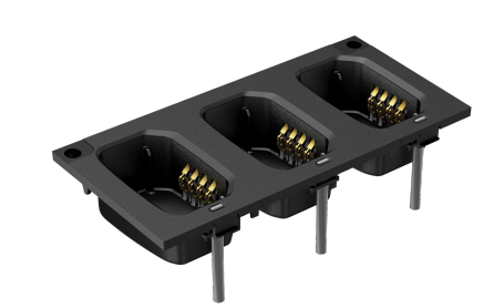
ION BATTERY ADAPTER FOR MOTOTRBO PMPN4284 MULTI-UNIT CHARGER