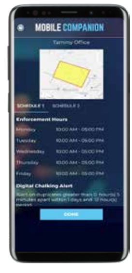
Geo-Zone Location View

Questions? For custom pricing and other inquiries, please contact Vigilant Solutions Sales at 925.398.2079 or sales@vigilantsolutions.com