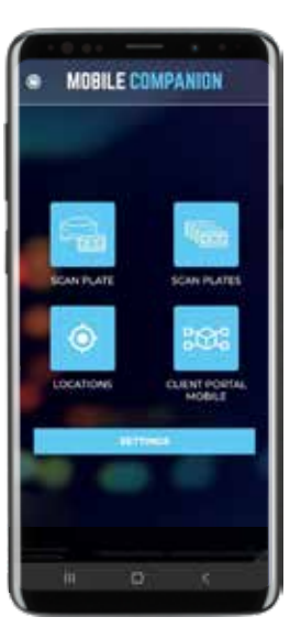
Vigilant Mobile Companion