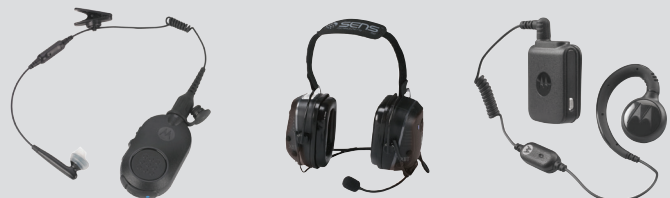
NNTN8294 (Wireless Pod not included)

Wireless accessories give you the flexibility to remove the radio from your belt and stay connected within 30 feet. We've embedded Bluetooth in to your XPR 7000 Series radio so no adapter is needed. A full portfolio of wireless accessories are available to meet your specific business needs. The XBT Heavy-Duty Wireless Headset is the state-of-the-art digital headset that unleashes the power of MOTOTRBO radios to shield you from harmful, high-decibel noise while letting you hear the sounds you need to – people, alarms, alerts and more.