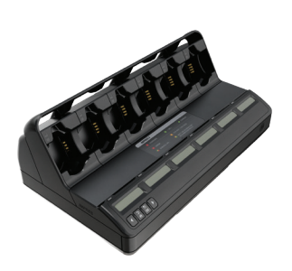
IMPRES 2 Multi-Unit Charger NNTN9115