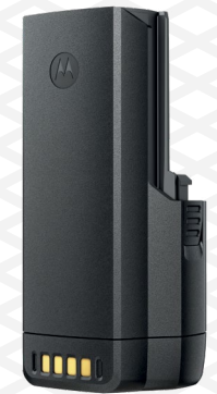
IMPRES 2 High Capacity Battery, Div 2

With the IMPRES™ 2 High Capacity Battery, you'll get more talk time. With improved water resistance, you'll never think twice about submersion. And a typical battery life of 14 hours with the standard battery and 18 hours with the high capacity battery ensures your lifeline works when you need it. For when your battery does need a recharge, Motorola Solutions offers two UL Div 2 IMPRES 2 fast charging solutions to charge one or several batteries simultaneously so your fleet is always ready for the next shift.