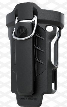
APX NEXT XE Classic Holster

We've designed APX NEXT XE carrying accessories to ensure your radio remains easily retrievable for quick use, but secure and in place for whatever your call entails. Notably, the classic holster is equipped with a D-ring and belt clip which allows the user to attach the radio to a radio strap or belt right out of the box. The holster design also allows for drop-in charging, battery swap of any size, and insertion of the radio while attached to the RSM.