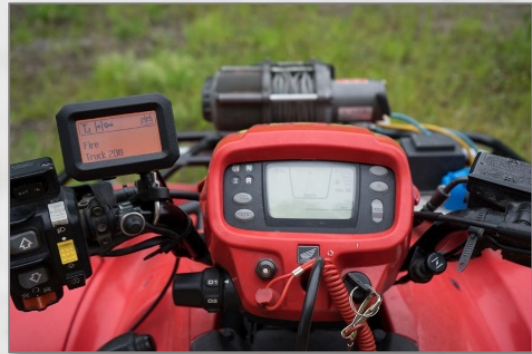
Installed on a quad bike

There are different back covers for the panel in order to mount it at different places, for example on an flat surface, from the rear of a panel or on a handlebar. Special back cover versions can be designed to fit any customers' specific needs.