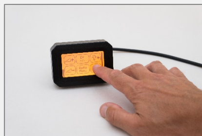
All at your finger tips