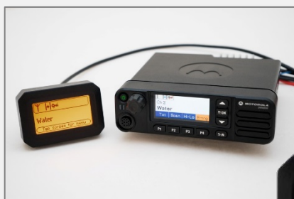
Sirius Panel + Radio