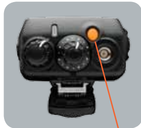
Dedicated Programmable Emergency Button

Industrial and commercial workplace safety programs require emergency preparedness when accidents or hazardous situations arise. This includes a plan to alert help instantly. The Emergency alert function is programmed by your Dealer and is designated to transmit an emergency notice on a specified channel. With a press of a button, the radio transmits an emergency alert to call for help or to notify others to implement the emergency action plan.