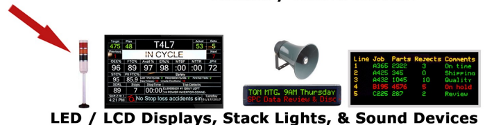
LED / LCD Displays, Stack Lights, & Sound Devices