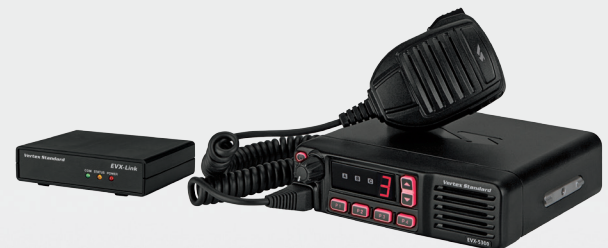
EVX-Link and EVX-5300