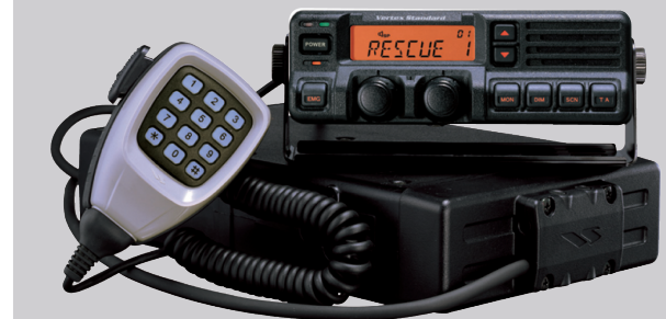
REMOTE MOUNT CONFIGURATION