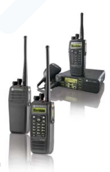
Motorola MOTOTRBO XPR Digital Radios