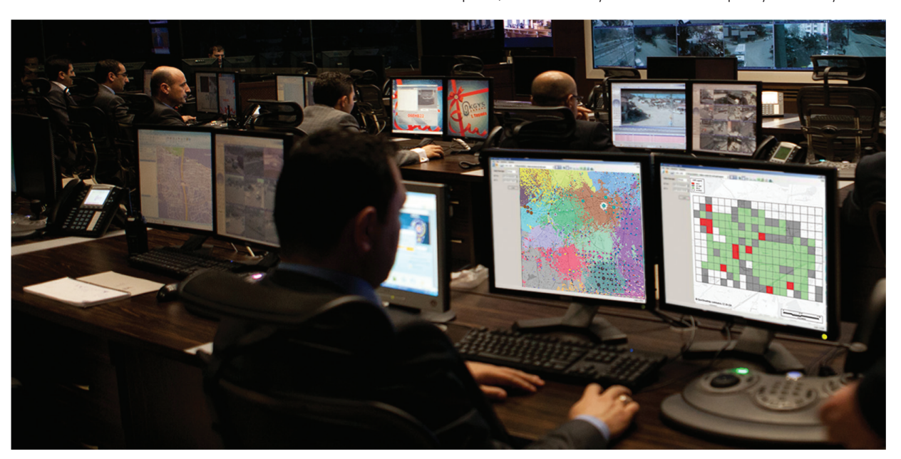
* iTM (Integrated Terminal Management System) is Motorola's efficient TETRA radio management solution for centralised and automated radio programming, software maintenance and upgrade. To implement TRACES, customers must have drive test data available and/or have Motorola iTM release 4.0 or later and subscriber software MR 5.10 or later.

If you solely operate the network, then GPS data capture via Uplink Measurement Reports (UMR) is the option to choose; if you also manage your own devices, you can add the Downlink Measurement Report (DMR) module to capture device error-log downloads; plus there's a module which gives you the ability to upload, view and analyse drive-test data quickly and easily too.