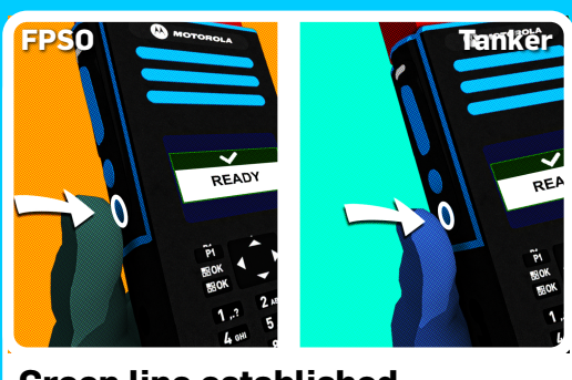
Green line established