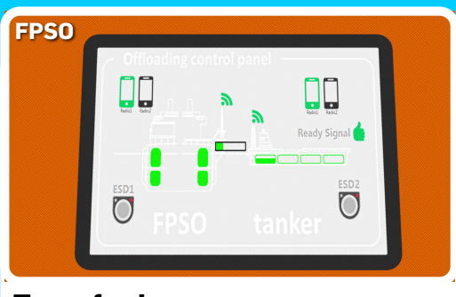
Transfer in progress