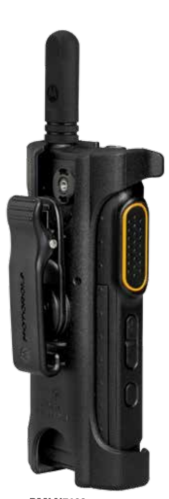
PMLN7190 Carry Holder/Holster with Swivel Belt Clip

By spending countless hours in the field with customers, we've developed accessories that aren't just the most innovative. But also the most useful.