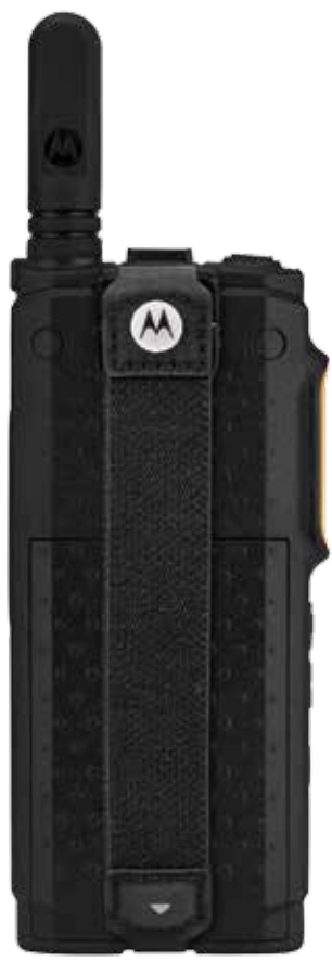
PMLN6074 Nylon Wrist Strap