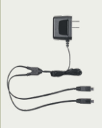
2 x Micro-USB Wall Charging Cables