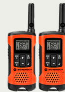
2 x T265 Radio