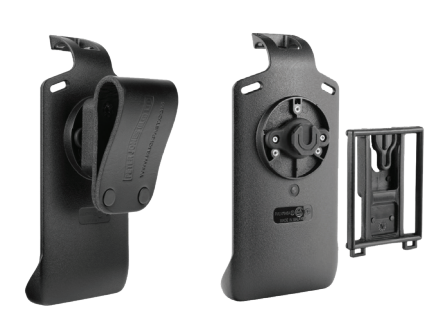
LEX L11 HOLSTER WITH AUDIO ROUTING TECHNOLOGY