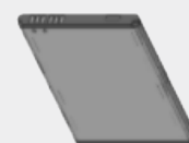
STANDARD 2900mAh LI-ION BATTERY BT000592A01