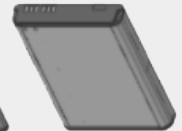
HIGH CAPACITY 5800mAh LI-ION BATTERY* BT000593A01