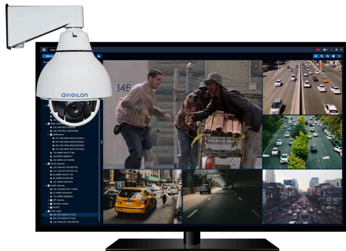
Avigilon Control Center

All of this comes together to provide you with better insights — so you always know what is happening at your site.