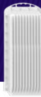
MTS1 base station (1 base radio)