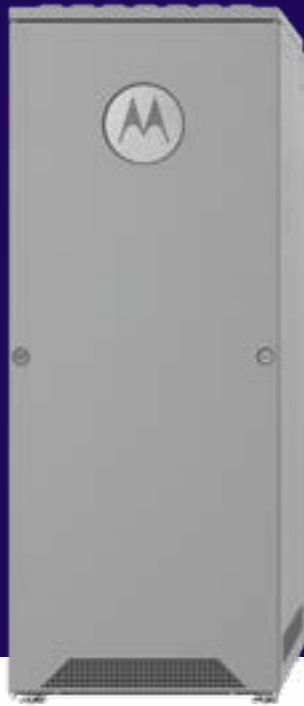
MTS4 base station (holds up to 4 base radios) 1