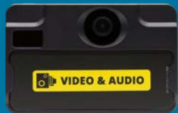
VT100 Body camera

Providing clear and reliable video documentation alongside instant communication enables staff to quickly de-escalate situations, effectively respond to challenges including theft, coordinate tasks and ensure the well-being of both employees and customers