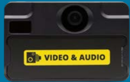
VT100 Body camera

Providing clear and reliable video documentation alongside instant communication enables staff to quickly de-escalate situations, effectively respond to challenges including theft, coordinate tasks and ensure the well-being of both employees and patients.