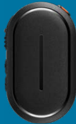
TLK 25 wearable WAVE PTX device