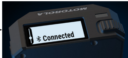
5. Bluetooth connectivity