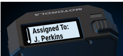
7. Officer name