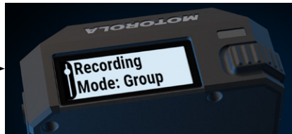
2. Recording Mode ("Group" if associated to a recording group or "None" if not associated with a recording group)