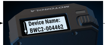
6. Device name