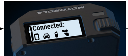
3. Connections to peripherals (SmartControl app, Vehicle WiFi base, APX radio, Holster Sensor). Icons only show when the camera is actively connected to a peripheral.