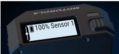
4. Holster Sensor battery screen