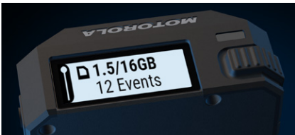
1. Storage information and number of events

To scroll through selections, press the side button. To select, press the top button.