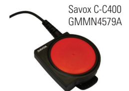
Savox C-C400 GMMN4579A

Complete the solution with the Savox C-C400 com-control unit that enables the use of your two-way radio in hazardous conditions. Designed to be especially robust for the most extreme environments, the extra-large push-to-talk button ensures transmission even when used underneath gear and protective clothing.