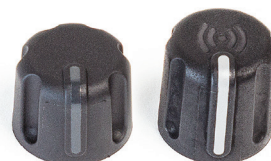
Standard Control Knob RFID Control Knob

◀ Optional colour identification bands for groups with different tasks, coverage areas or shifts