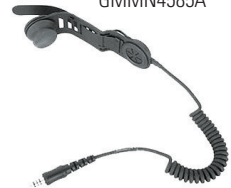
Savox HC-1 GMMN4585A

Complete the solution with the Savox C-C400 com-control unit that enables the use of your two-way radio in hazardous conditions. Designed to be especially robust for the most extreme environments, the extra-large push-to-talk button ensures transmission even when used underneath gear and protective clothing.