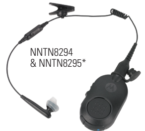
NNTN8294 & NNTN8295*

Bluetooth 2.1 audio is embedded in the radio enabling fast and secure pairing with a variety of Bluetooth accessories. Easy to attach and pair, Motorola Bluetooth accessories enhance performance and security wherever you work. Officers can talk discreetly undercover, move without wires and use their radio like never before.