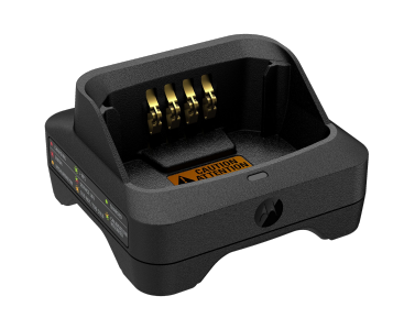
IMPRES 2 SINGLE-UNIT CHARGER