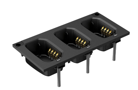
ION BATTERY ADAPTER FOR MOTOTRBO PMPN4284 MULTI-UNIT CHARGER