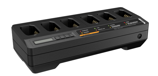
IMPRES 2 MULTI-UNIT CHARGER - 6 POCKET