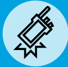
Durability / Reliability