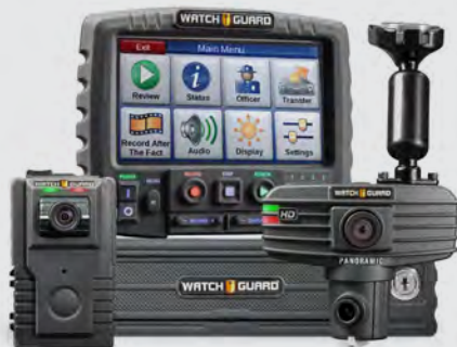
IN-CAR VIDEO SYSTEM