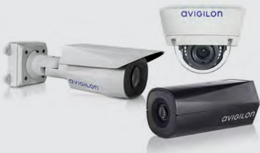
UNUSUAL MOTION DETECTION AND APPEARANCE SEARCH