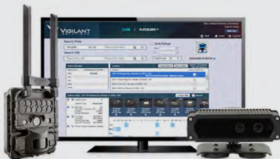
AUTOMATIC NUMBER PLATE READERS