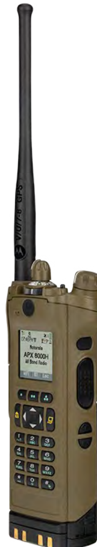
APX 8000H SRX Package