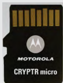
CRYPTR MICRO DEVICE ENCRYPTION