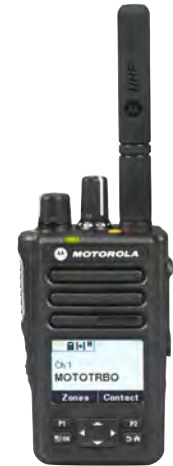
DP3000e / XiR E8600i Series

This compact radio matches the performance of the rugged portable, but is packed into a tough, compact form factor. It's one third smaller in volume, but meets MIL-STD-810 for ruggedness and is IP68 rated to withstand damage from dust and water.