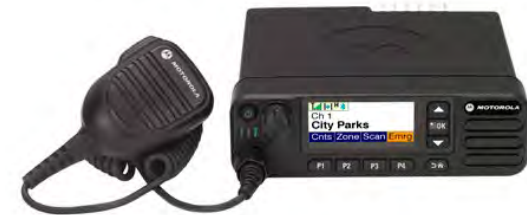
DM4000e / XIR M8600i Series