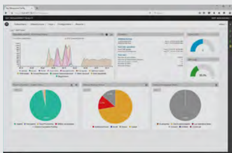
KEY MANAGEMENT FACILITY (KMF)