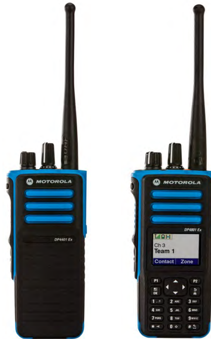
DP4000 Ex / XIR P8600 EX Series