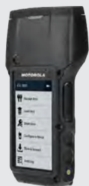
KEY VARIABLE LOADER (KVL)