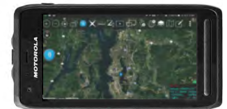
LEX L11 Mission-Critical Secure Broadband Device, designed with the National Guard and First Responders in mind.