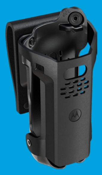
HYBRID LEATHER CARRY CASE