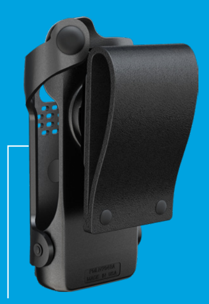
HYBRID LEATHER CARRY CASE - BACK VIEW (Swivel Belt Loop sold separately)