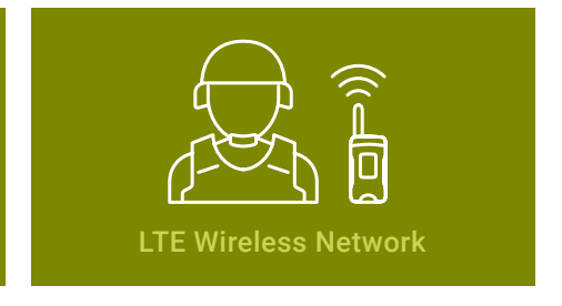
4G LTE cellular communications provide land forces secure and reliable voice and data communications with LPI/LPD.