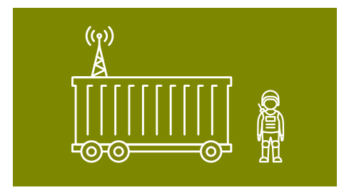
Provide alternatives when satellites are not available and integrate with existing backhaul systems.