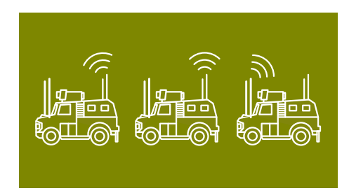
Motorola Solutions networks at deployed headquarters provide secure voice and data communications.

So you can achieve your mission of protecting Australia's interests at home and abroad.