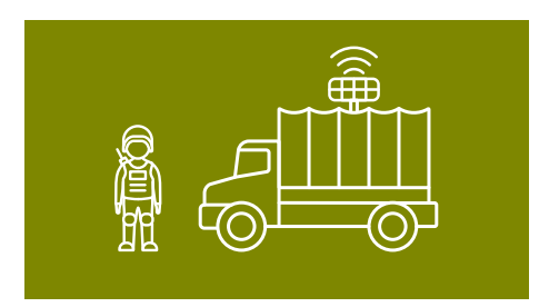
High frequency (HF) radio propagation provides radio communications at deployed sites.