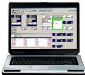
MCC 7100 Console