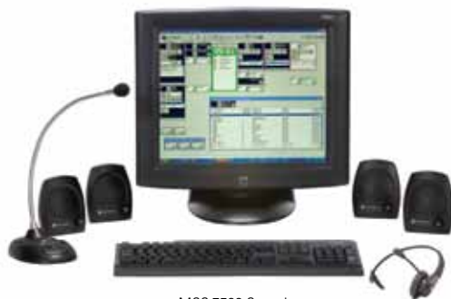
MCC 7500 Console