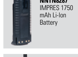
NNTN8287 IMPRES 1750 mAh Li-Ion Battery