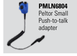
PMLN6804 Peltor Small Push-to-talk adapter