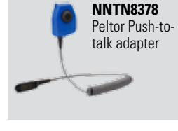
NNTN8378 Peltor Push-to-talk adapter