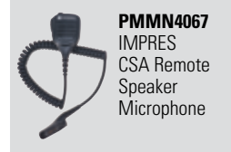
PMMN4067 IMPRES CSA Remote Speaker Microphone