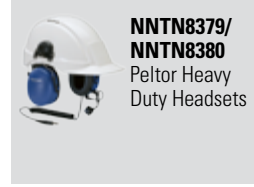
NNTN8379/ NNTN8380 Peltor Heavy Duty Headsets