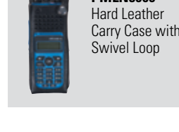
PMLN5606 Hard Leather Carry Case with Swivel Loop

Motorola Solutions, Inc. 1301 E. Algonquin Road, Schaumburg, Illinois 60196 U.S.A. 800-367-2346 motorolasolutions.com