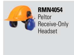
RMN4054 Peltor Receive-Only Headset