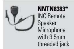
NNTN8383* INC Remote Speaker Microphone with 3.5mm threaded jack

For more information on how to connect with greater confidence and work with greater safety, visit motorolasolutions.com/mototrbo