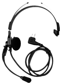
Headset with Swivel Boom Microphone BDN6773A