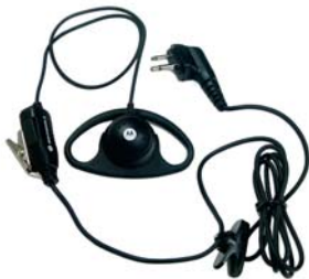
Earpiece with inline PTT & Microphone 56517