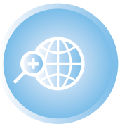
MOTOTRBO Location Services