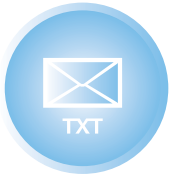
MOTOTRBO Text Messaging Services

C, D, E, and F, and, for portable radios, IP57 for submersibility in water. MOTOTRBO portable radios are intrinsically safe and can be used in locations where flammable gas, vapors or combustible dust may be present. MOTOTRBO goes the extra mile in battery life, too, operating up to 40 percent longer per charge than traditional analog radios.