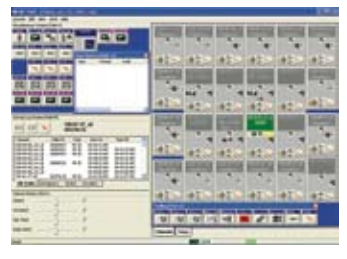
Customizable Channel Control

The MIP 5000 GUI provides extensive user options for full control of the display.