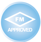
Factory Mutual Approved