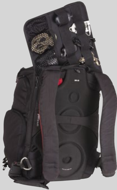
Note: Backpack not included with case