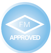
Factory Mutual Approved

MOTOTRBO™ also makes communication easy with audio that stays clear to the edge of coverage—plus digital noise suppression to aid communication in noisy environments. Moreover, MOTOTRBO™ supports integrated data applications, including text messaging. So you can always get messages through.