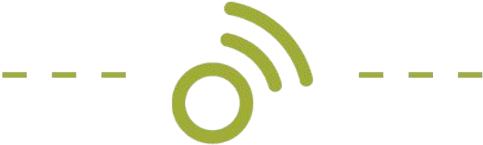
TELDIO EDGE GATEWAY