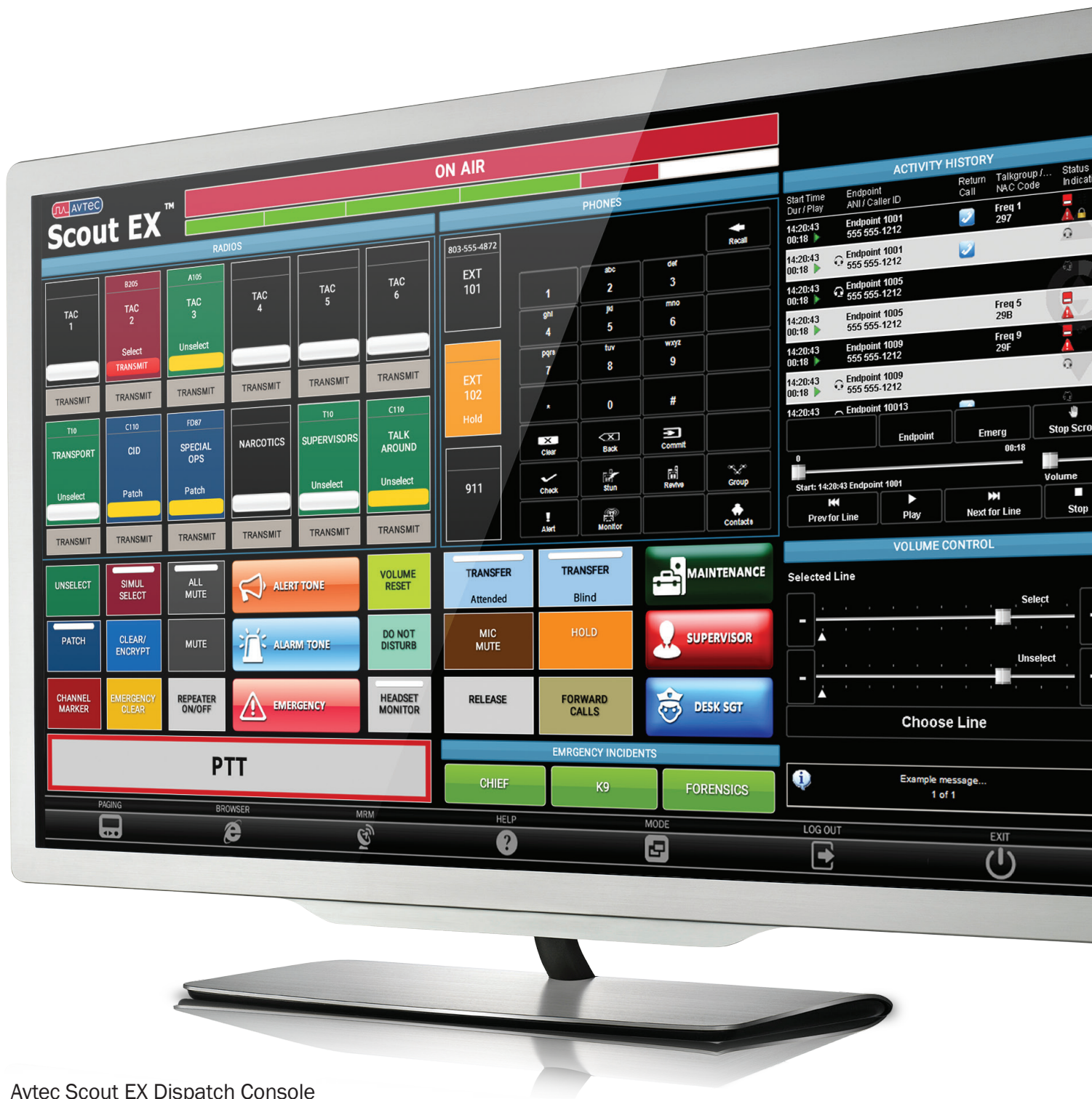
Avtec Scout EX Dispatch Console