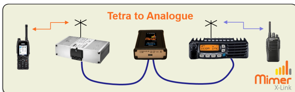
A Tetra radio cross patched together with an analogue radio

The X-Link Interface runs on 12VDC just as most radios and is therefore easy to power from the same source as the radio, and to feed with backup power. If power is lost, the X-Link Interface will restart itself in a matter of seconds when the power comes back.