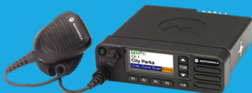
XPR 5000 and XPR 5000e Series