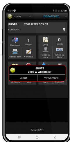
Android Dashboard Dispatch Notification

First responders have access to real-time information from PremierOne CAD, PremierOne Records and local, state and federal databases. Users easily access information they need via a simple, one-step navigation experience throughout the PremierOne Mobile application enabling more informed decisions and quicker, safer, and more efficient resolution.