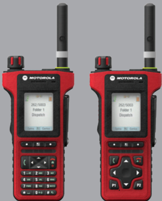
MTP8550Ex UHF FKP ATEX PT951NPEEX Full Keypad