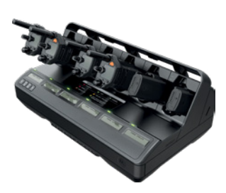
IMPRES 2 Multi-Unit Charger NNTN9115