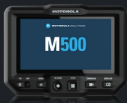
M5D CONTROL PANEL