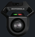
M5F FRONT CAMERA