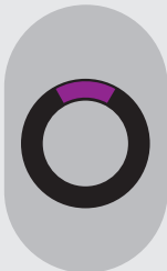
Purple Active Channel