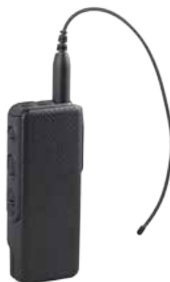
VHF FLEXI ANTENNA PMAD4125