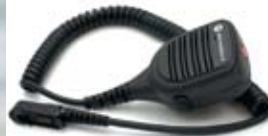
Enhanced large remote speaker microphone with noise-canceling microphone, loud audio, audio jack and emergency button, IP54.