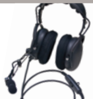
Dual-muff over the head headset with boom microphone and in-line push-to-talk, 24 dB NRR.