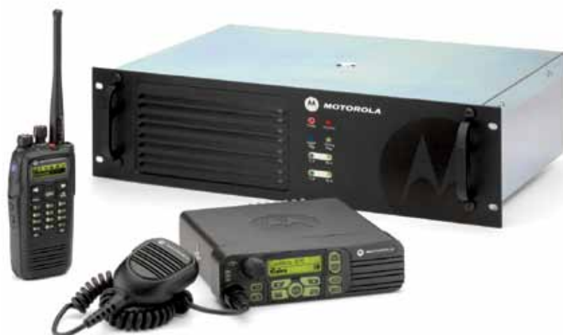
MOTOTRBO™ portable, mobile and repeater.

With an effective system to provide task management, track progress and improve responsiveness of their caregivers, healthcare providers can perform their work quickly and accurately, and avoid costly errors. They can enhance clinical performance and improve the delivery of patient care.