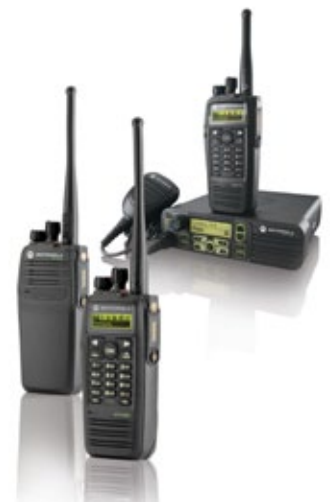
Motorola MOTOTRBO XPR Digital Radios